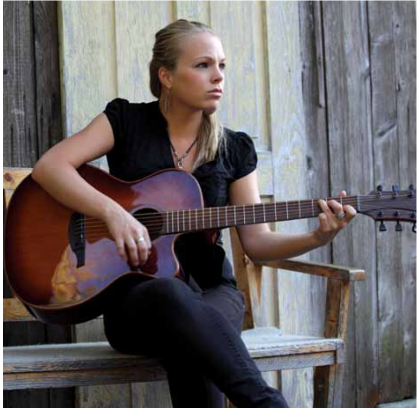
Flagstaff stages many concerts and events year-round for music lovers, including a folk festival.

The nonprofit group Flagstaff Friends of Traditional Music works to preserve, promote and share all types of American folk music and dance, especially bluegrass. The group hosts the Flagstaff Folk Festival, which features more than 150 acts as well as workshops, impromptu jams and much, much more. At its 10th Annual Picking in the Pines, scheduled for September 2015, musicians perform additional types of genres like Celtic and gypsy jazz, as well as participate in a band contest. ♦ By Mallorie Ann Ingram